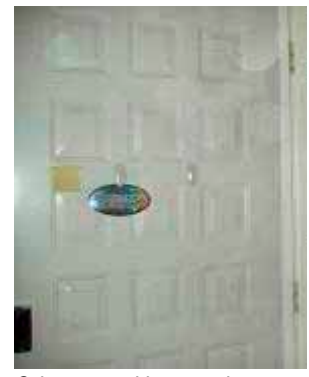
Orbs created by spraying water.