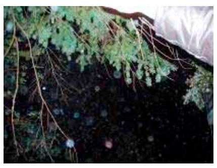
Orbs created by shaking a dust cloth

The photos taken by shaking a dust cloth, or spraying water into the air in front of the camera lens produced pictures similar to the orbs photographed by others. In addition to dust and water, pollen and insects may also cause orbs. Small airborne particles account for probably 98%+ of orb photos. However, some pictures of rapidly moving colored orbs do not match the control photos we produced. These atypical pictures merit more investigation. We are writing a comprehensive article for the IEA web site, stay tuned. . .