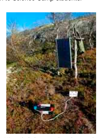
Hi-tech Solar panel on low-tech branches charge batteries on Rognefjell mountain during Science Camp