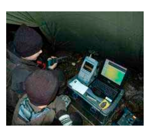
Students radio results from electromagnetic spectrum analyzers inside the mountain camp tent, to the base station at the school