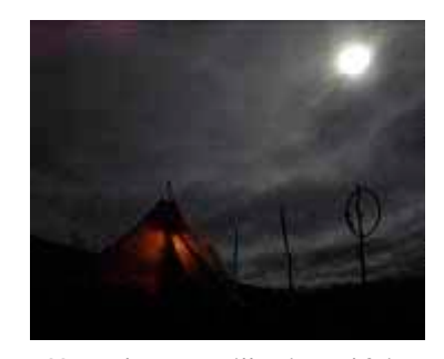
Moon glows over illuminated Science Camp tent and antennas, Rognefjell mountain, Norway Photo: Bijorn-Gittle Hauge 2004