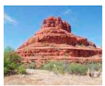
Bell Rock, Sedona AZ