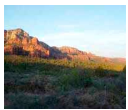
Near Bradshaw Ranch

Although no anomalous lights were seen near Sedona, there was an interesting finding at a large outcropping of red rock called Bell Rock. Lights have been reported in the vicinity of Bell Rock. The new-age community claims that several "energy vortices" exist in the Sedona area. (We had difficulty finding definition of the exact nature of a "vortex". While several books have been published giving mostly non-scientific opinions about the nature of a "vortex", none that we found offered a physical explanation or credible measurements.) One of the vortices is claimed to be